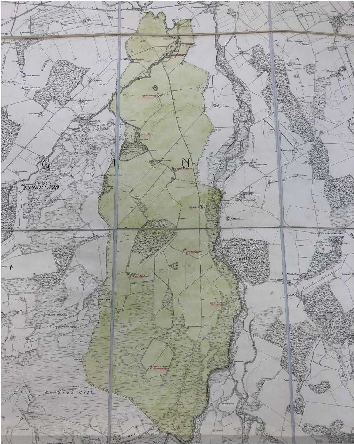
Figure 1: Manbeen & Pittendreich Lands of the Earl of Moray (in green).

not shown on the plan but the only area of that relevant at Pittendreich is the woodland directly NW of Nether Bogside.” 2